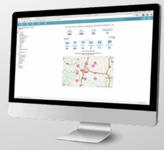
Meter geolocation system

offers an economical alternative to fixed network infrastructures, since it allows operational data to be recorded, managed and analysed efficiently and frequently.